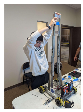
Bottanks over the years